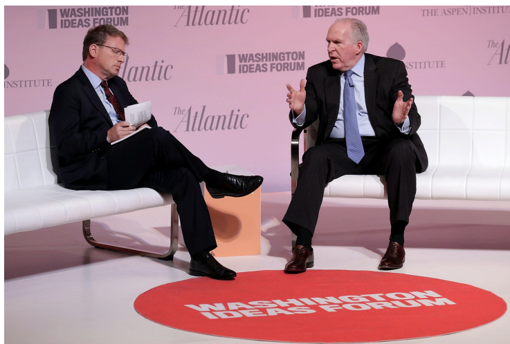
WASHINGTON, DC - Former Obama CIA Director John Brennan (R) with The Atlantic's Editor-in-Chief Jeffrey Goldberg during the Washington Ideas Forum at the Harman Center for the Arts

The Trump era has engendered numerous fractures, one might say realignments, in the political order. Long-time ideological allies are now adversaries, and long-time political enemies are now in full-fledged coalitions. These shifts are not temporary or Trump-dependent but enduring, because they are grounded in shared core beliefs about the defining debates shaping our new politics and how to consolidate real power: call it the Lincoln Project Syndrome.