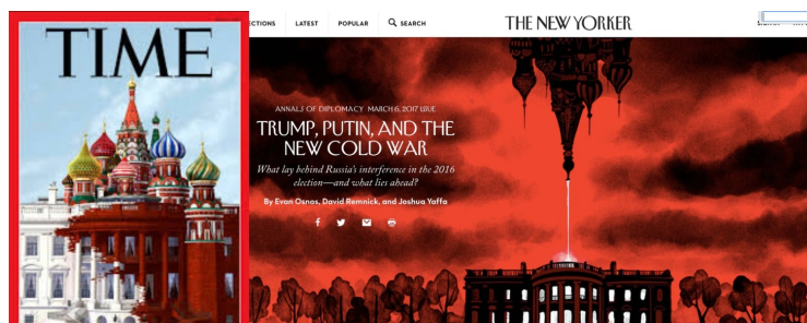
Cover of TIME Magazine, May 18, 2017; Cover of The New Yorker, Feb. 24, 2017

That's why the millions of Americans who, due to fear of Trump, began paying close attention to politics and consuming news products only in 2016 were such easy marks for peddling fear-mongering narratives and revisionism: because they lacked the crucial historical context in which to place Trump and understand his ascension to the presidency.